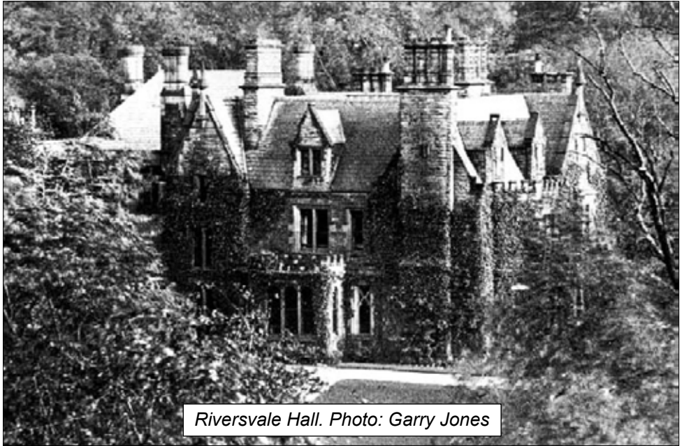
Riversvale Hall.