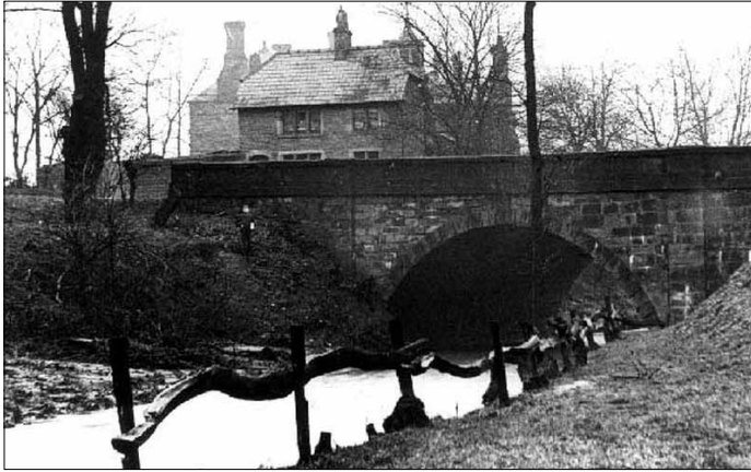
Riversvale Lodge and Valley Bridge, where the old road crossed the River Medlock, with the hall in the background behind the lodge.

been one of the main sources of the cotton that had brought prosperity to the region. As a result, a number of wealthy industrialists became collectors of Egyptian artefacts, which may have inspired Kate's interest in the subject.