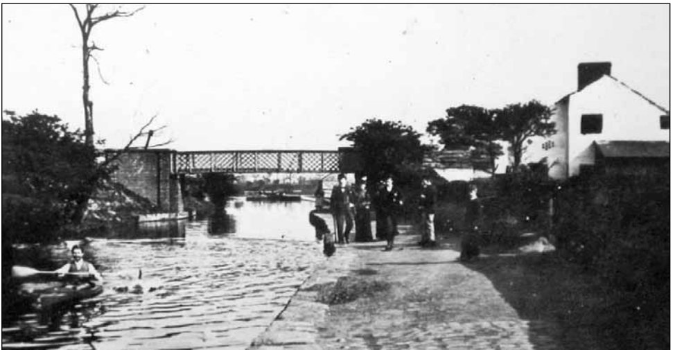
Pinch Farm (on the right) around 1900. The smartly-dressed walkers are undoubtedly taking a Sunday stroll. Note the canoeist who had paddled along from Crime Lake.

The original bridge, which was probably constructed of wood, was replaced around 1860 with an attractive riveted latticework wrought iron bridge with brick abutments.