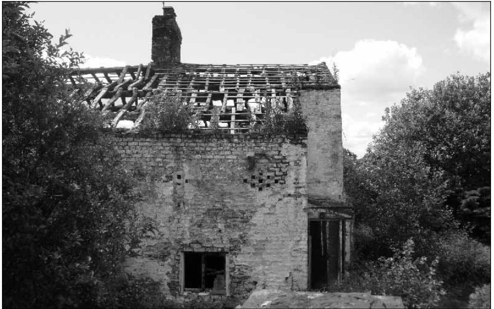
Pinch Farm in 2009 after the stone roof had been stolen.