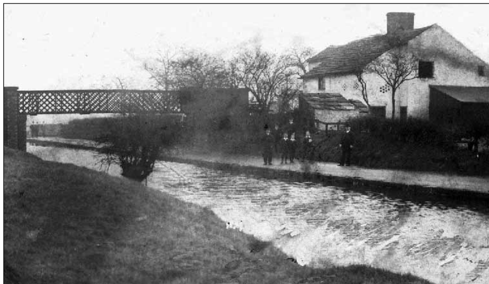
Pinch Farm around 1920.

The farm remained empty after Cyril's departure and thieves then stole the stone flagged roof. The inside of the