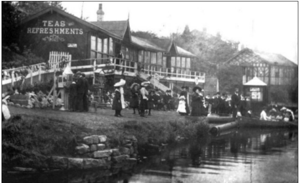
Edwardian leisure pursuits at Crime Lake.

In the first half of the nineteenth century there was a coal mine called Warmbly Wood Colliery located close to what is now the location of St Chad's Church in Limeside. A tram road led from the mine to the northern end of Crime Lake. The colliery and tramway are shown on an 1845 map but by the 1894 map the tramway has gone there is no sign of the colliery apart from waste heaps and disused shafts. During the period when the colliery was open, wagons would take coal down the tramway to be loaded onto boats on the lake. It is not known how the boats got to the loading